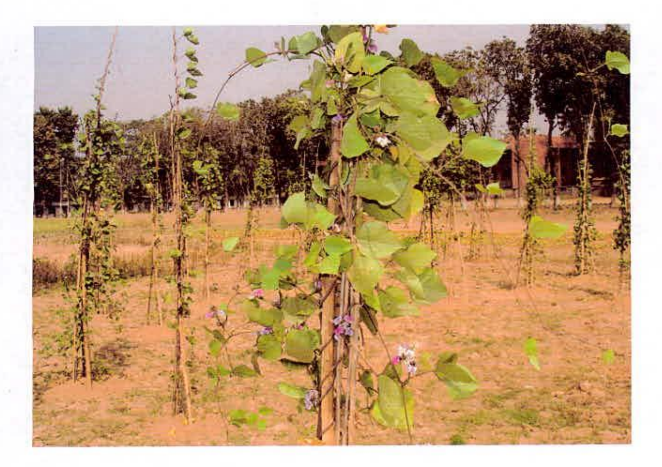
Plate 1a: Filed view of Country bean plants.