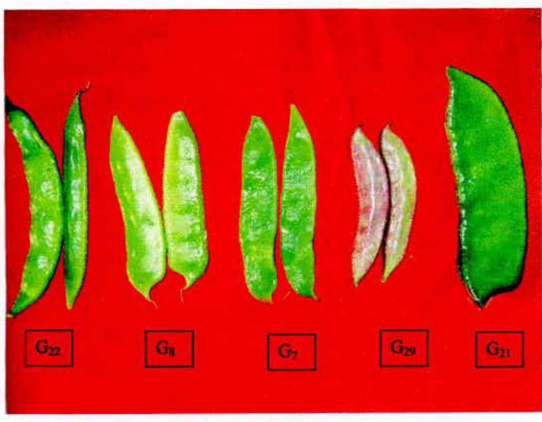
Plate 1c. Showing Variation in pod among different Country bean genotypes