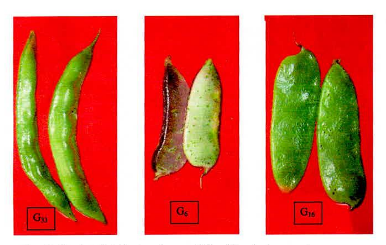
Plate 1b. Showing Variation in pod among different Country bean genotypes