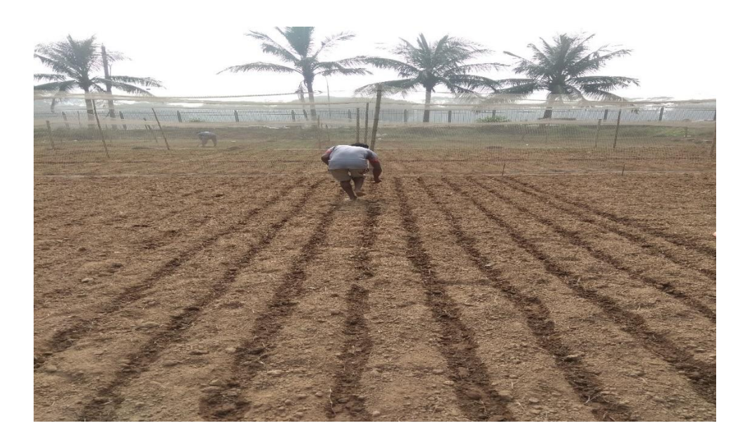
Plate 2. The view of experimental field during seed sowing