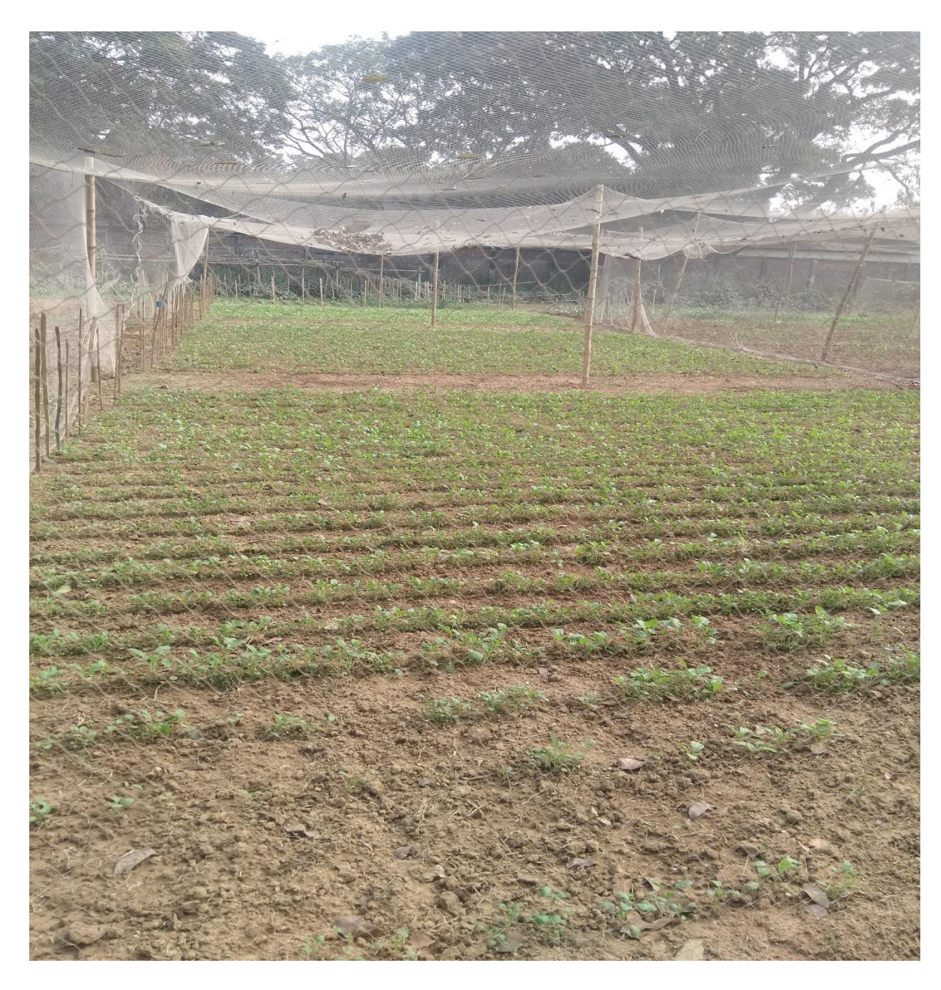
Plate 3. The view of experimental field during growth stage