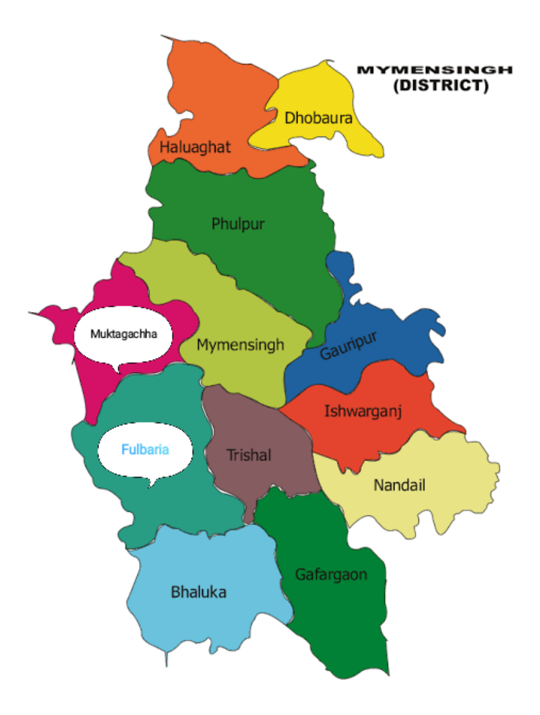
Fig: 3.1 A map of Mymensingh District