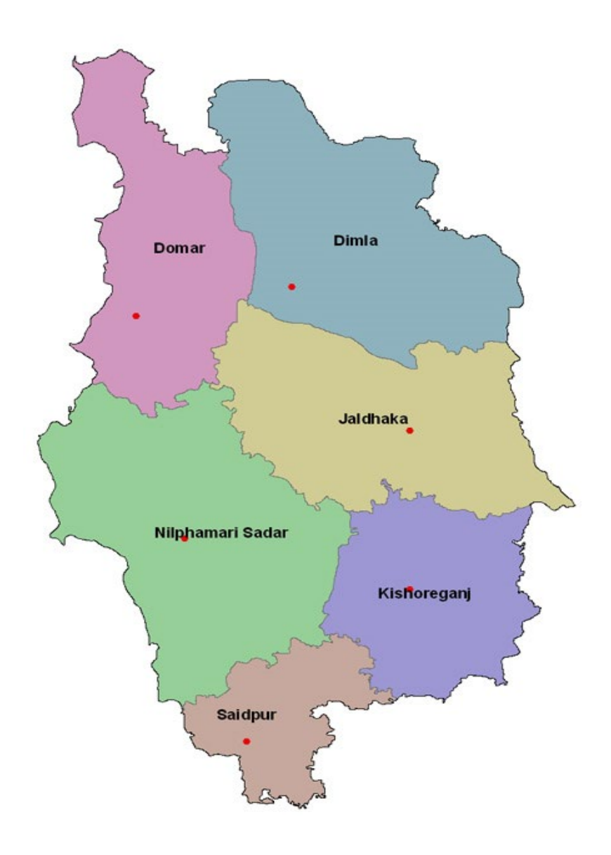
Figure: 3.1 A map of Nilphamari District