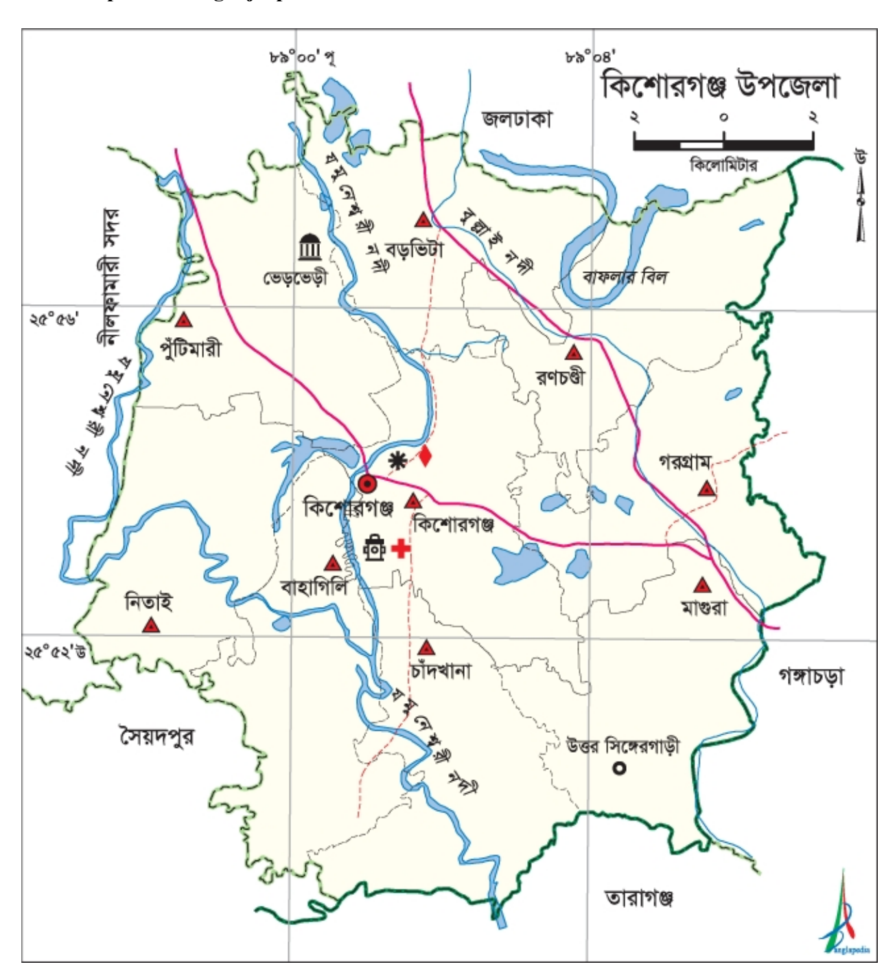
Figure: 3.2 A map of Kishorganj Upazilla