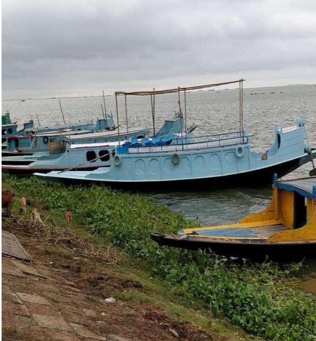
Figure 3: Scenario of Nikli Haor