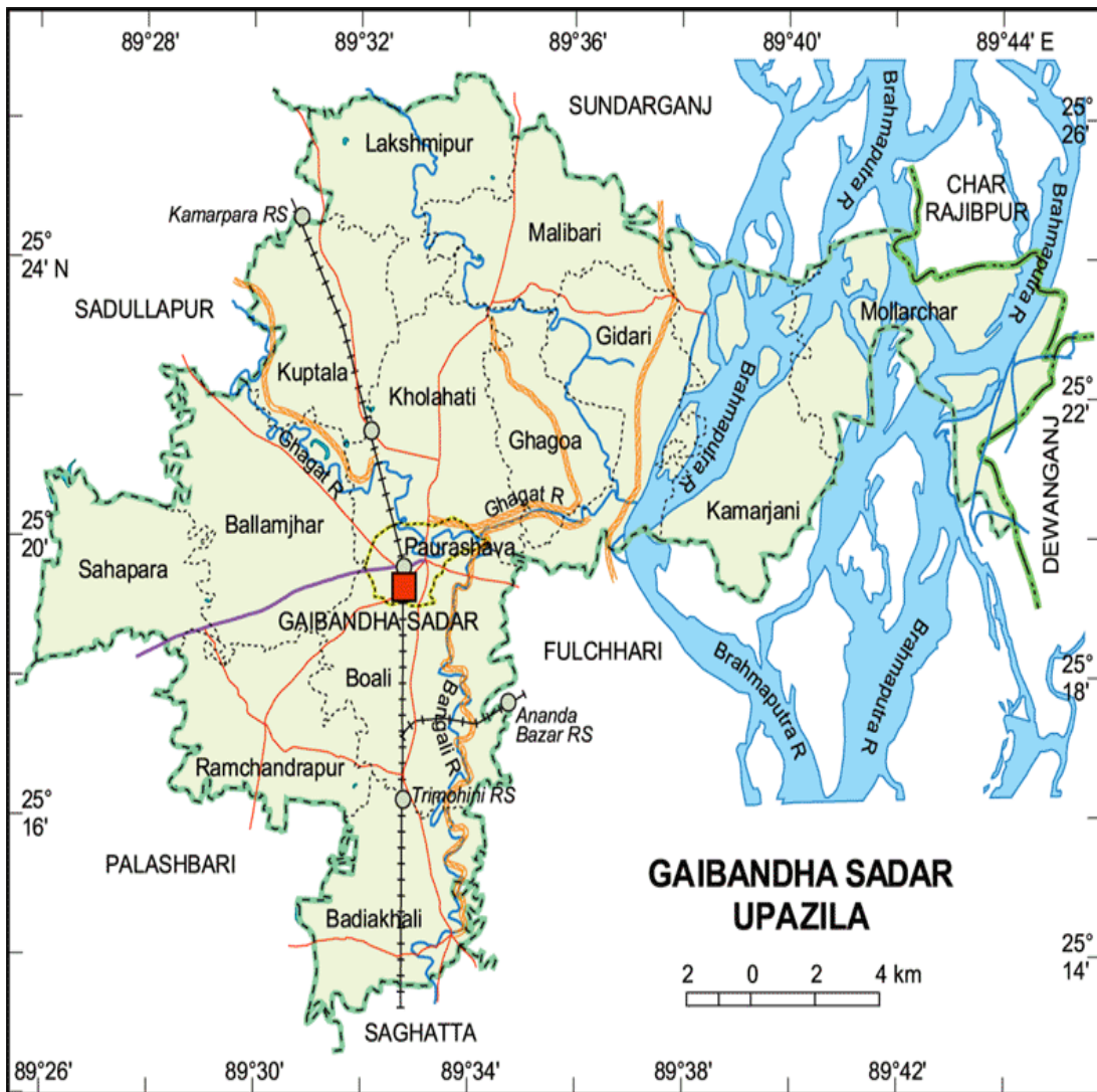
Figure 3.1: Geographical location of Gaibandha Sadar