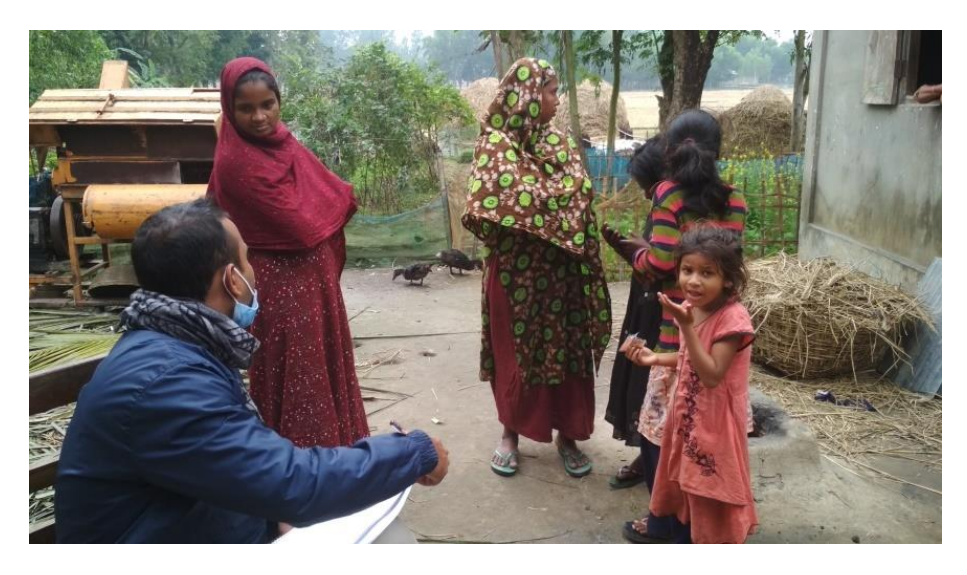
Plate 1: Data collection from a lady farmer