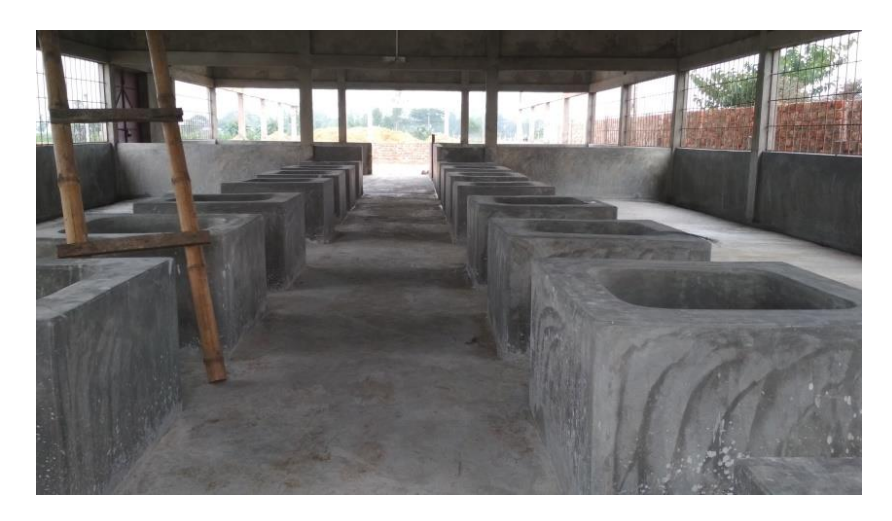
Plate 4: Modern buffalo farm under construction