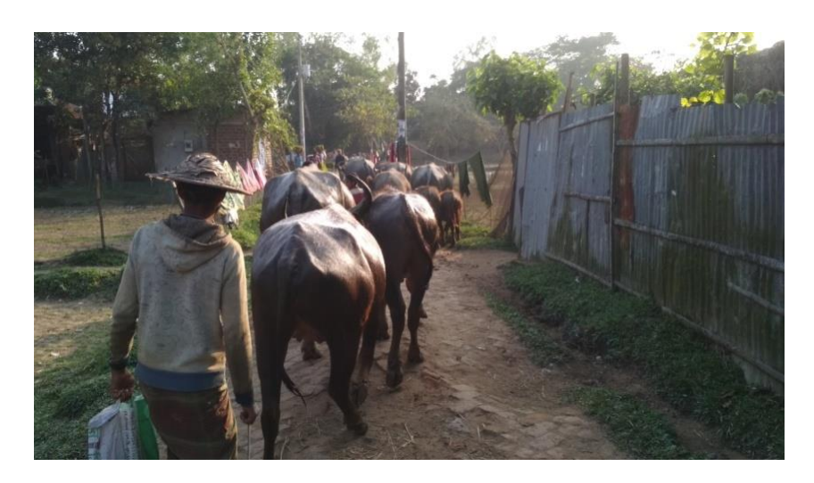
Plate 6: Coming back home after day long grazing