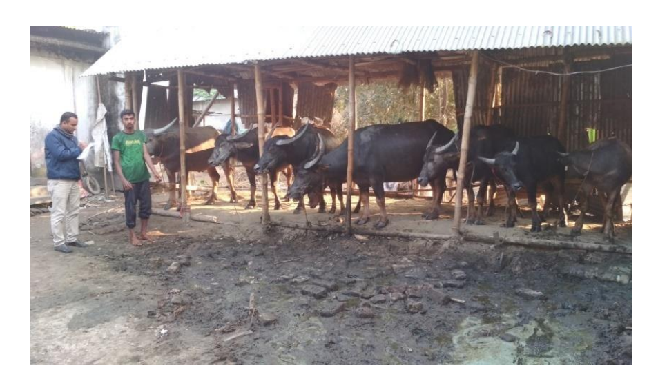
Plate 3: Data collection from a farmer