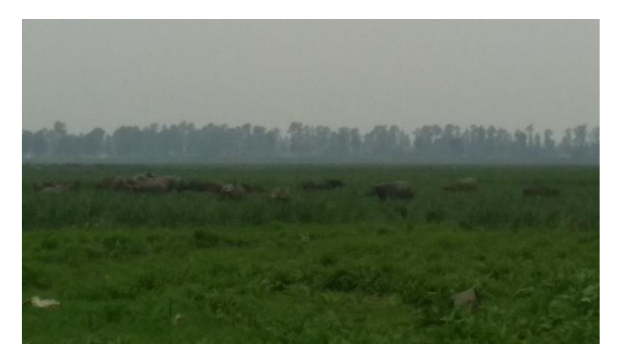
Plate 5: Buffaloes are grazing at a hoar