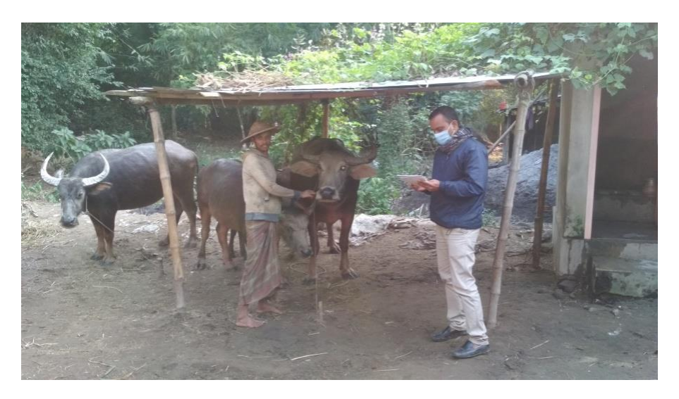
Plate 2: Data collection from a farmer