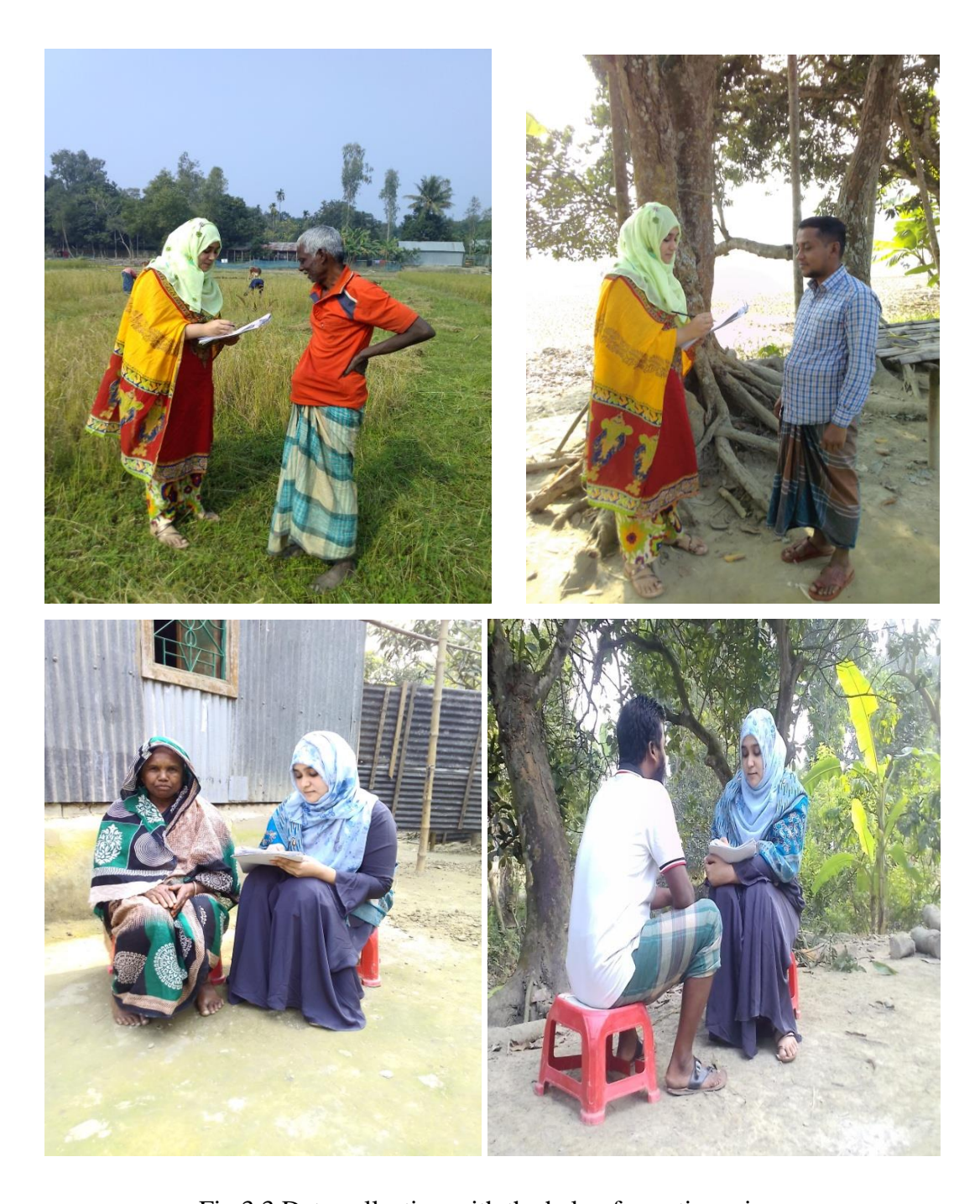
Fig 3.3 Data collection with the help of questionnaire.