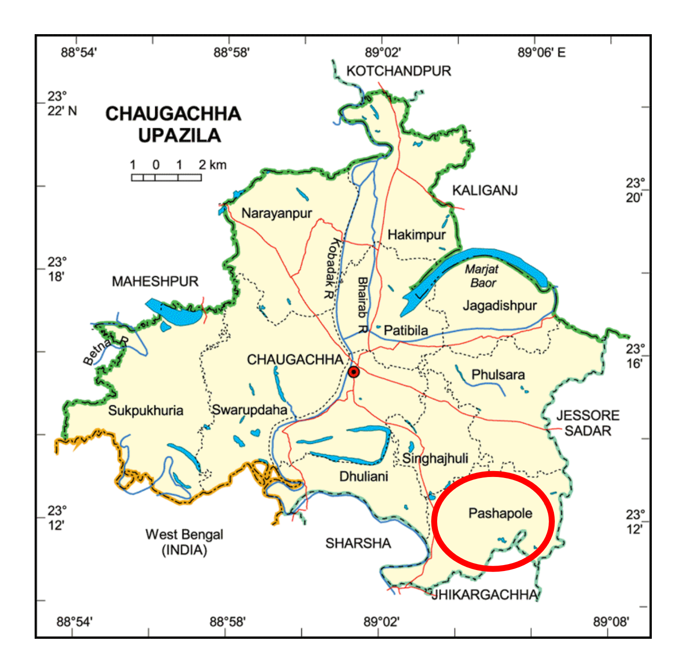
Figure 3.2 Map of Chaugachha upazila showing the study area