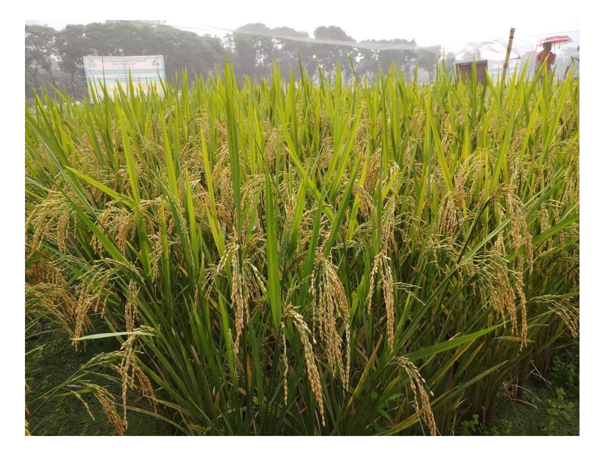
Plate 2. Photograph showing variation at 80% maturity stage

Significant variations were observed among the ten lines (11.78) for days to maturity (Table 3). The highest days to maturity was resulted in L8 (141 days) and the minimum days to maturity was found in L5 was 134 days (Table 4, Plate 2). The phenotypic and genotypic variance for days to maturity was observed 5.50 and 2.5 respectively suggested that the environment had significant role in the expression of trait. The phenotypic coefficient of variation (1.60%) was higher than genotypic coefficient of variation (1.36%) (Table 5) suggested that environment influenced on the expression of the genes controlling the trait. Similar result for this trait was also observed by Ketan and Sarkar (2014) in Aman rice.