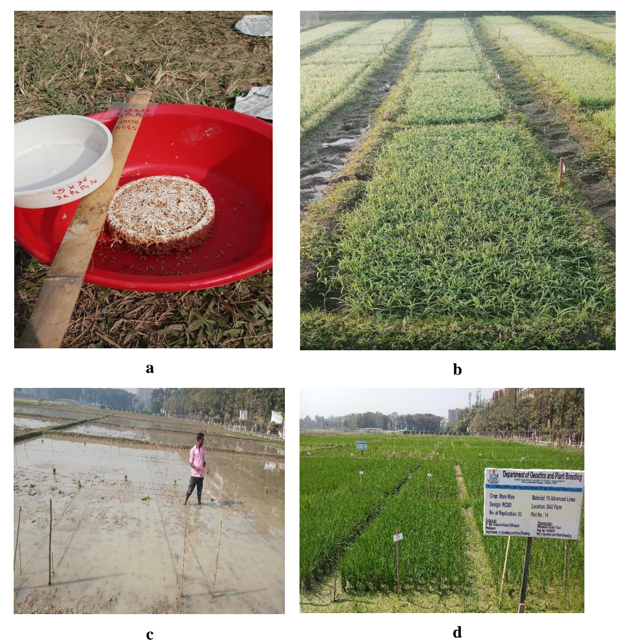
Plate 1. Showing a. Seed soaking for germination, b. Seed sowing in seed bed, c. transplanting in main field and d. Field view of experimental plaots.