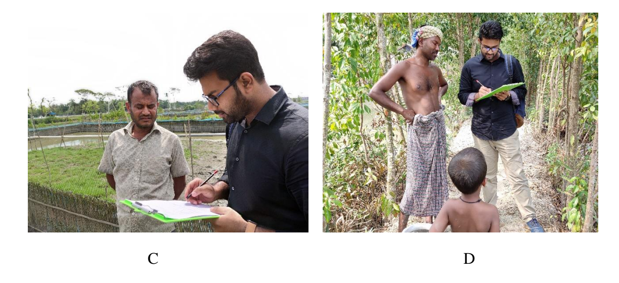
Plate 1 Photograph showing (A. Data Collection at Rampal Upazilla, B. Data Collection at Mongla Upazilla, C. Data Collection at Morrelgonj Upazilla, D. Data Collection at Sarankhola Upazilla) experimental site.