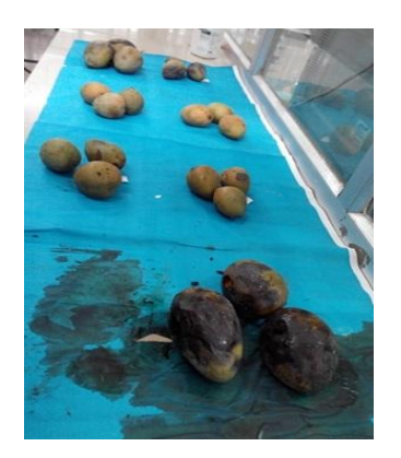
a. Treated Mango