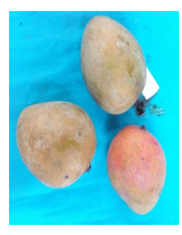
c. Tilt 250 EC