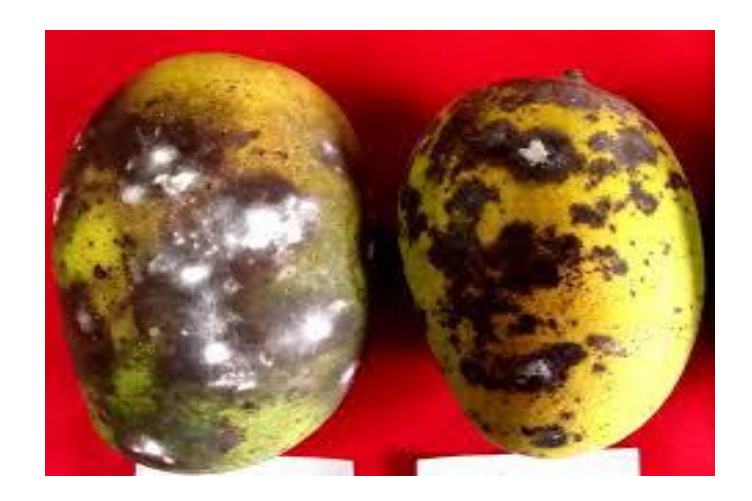
Figure 1. Infected mango with Anthracnose