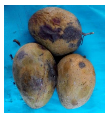
f. Austin 200 WGD

Fig 8: Effect of different fungicides (1000 ppm conc.) against anthracnose of mango at 7 days after treatments.