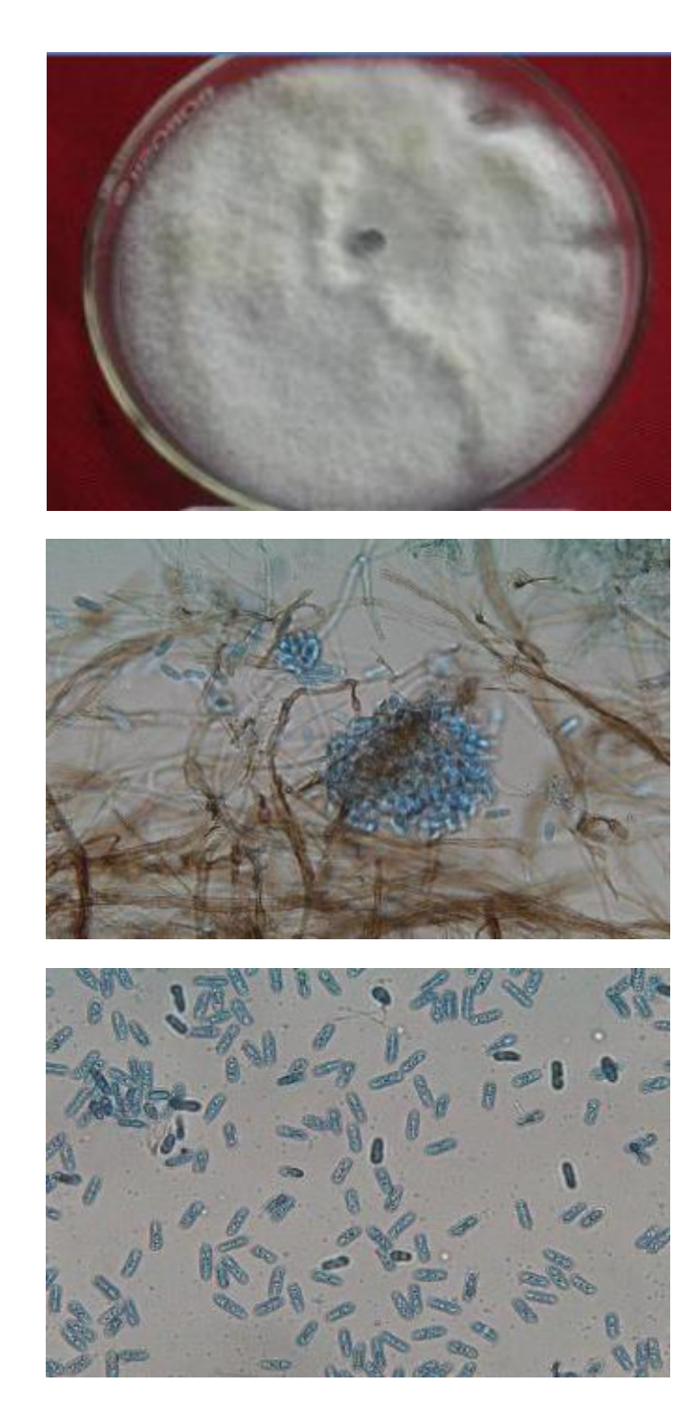
Figure 5. Structural presentation of C. gloeosporioides