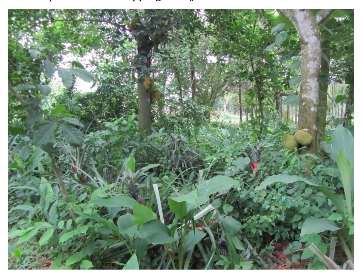
Figure 4.1: Adoption of intercropping by the intercrop farmers

Adoption scores of the farmers ranged from 1-64 with a mean of 11.76 and the standard deviation of 10.43. Based on the observed scores, the farmers were classified into three categories as shown in table 4.2.