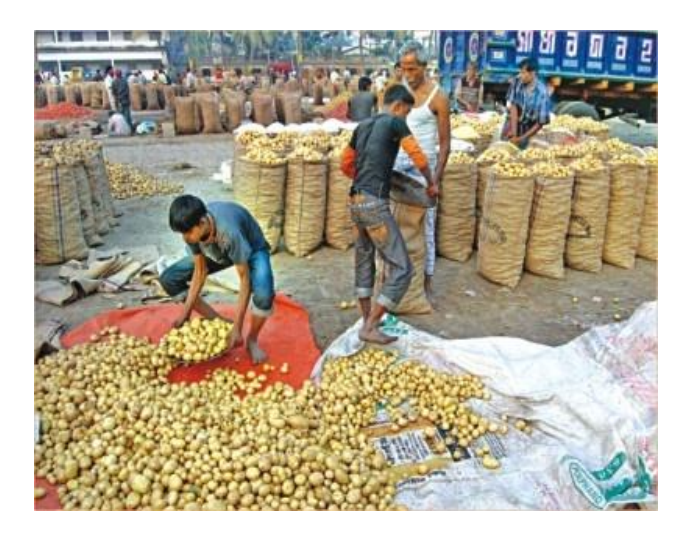
Plate-4. Potato selling in local market at Bogra