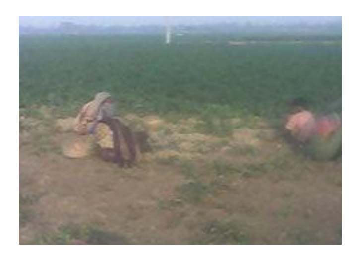
Plate-2. Potato collection by hand