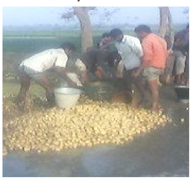
Plate-3. Washing of potato after harvesting