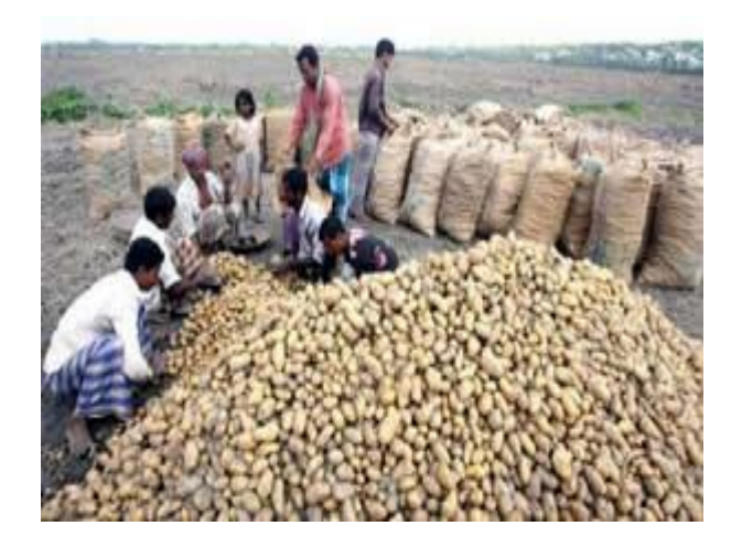
Plate-5. Bagging of potato for storage or marketing