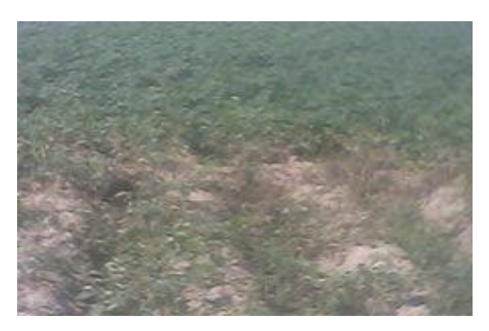
Plate-1. Spading in potato field before Potato collection