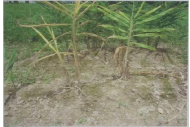
Figure.3 Rhizome rot infected experimental plot