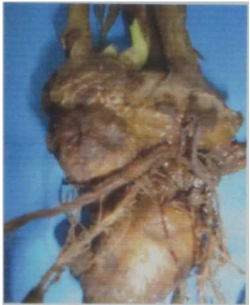
Figure 2 Affected rhizome caused by Rhizome rot disease