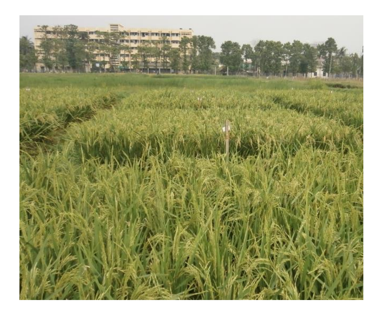
Plate 1. The experimental field of the present study at the central farm of SAU, Dhaka