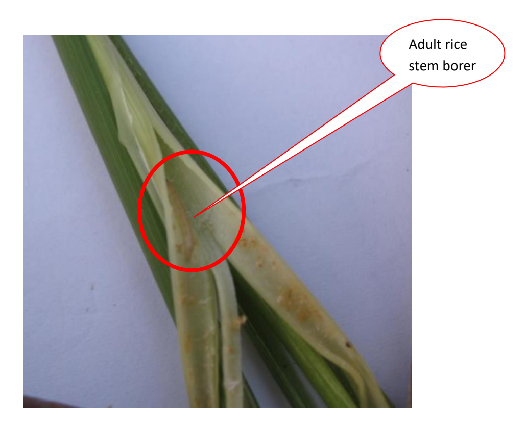
Plate 4. Infested rice sheath with caterpillar of due to white head symptom causes by yellow stem borer