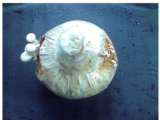
A. Pin head primordia in the spawn packet