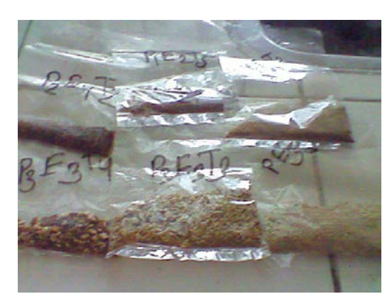
B. Prepared ground sample preserved for further analysis

A. Mushroom Samples kept for grinding immediately after removing form oven