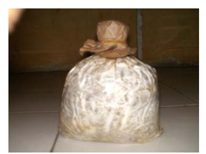
D. After 22 days of inoculation

Plate 1. Mycelium running stages of oyster mushroom in spawn packet after inoculation