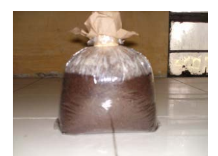
C. After 10 days of inoculation