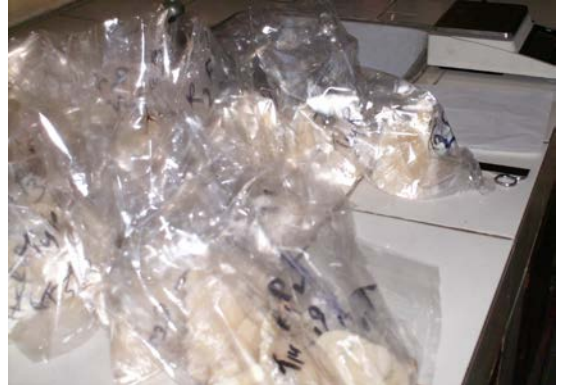
D. Fruiting body harvested from the spawn packet