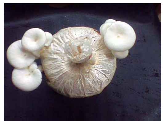
B. Young fruiting body in the spawn packet