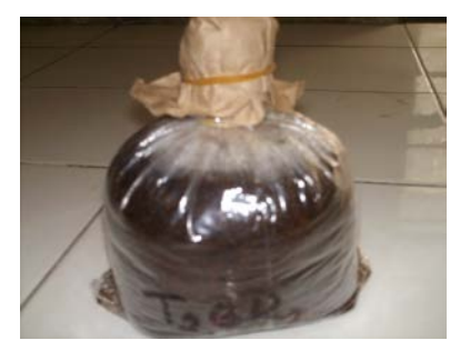
B. After 7 days of inoculation