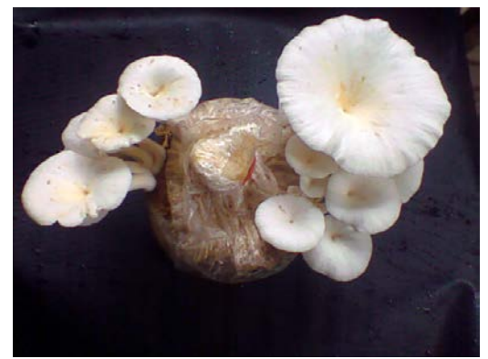
C. Matured fruiting body in the spawn packet