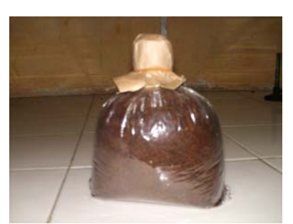
A. Immediately after inoculation