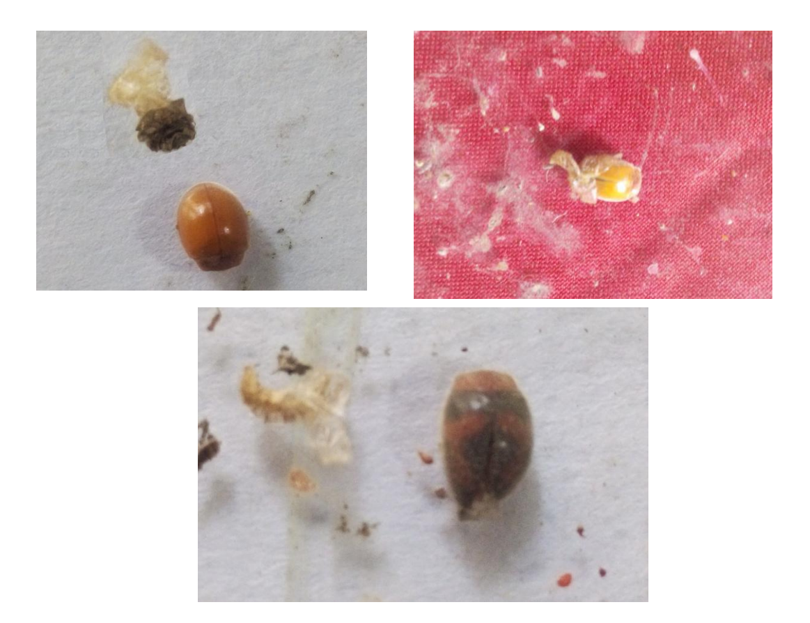
Plate 12. Adult of ladybird beetle (Rodolia sp.)