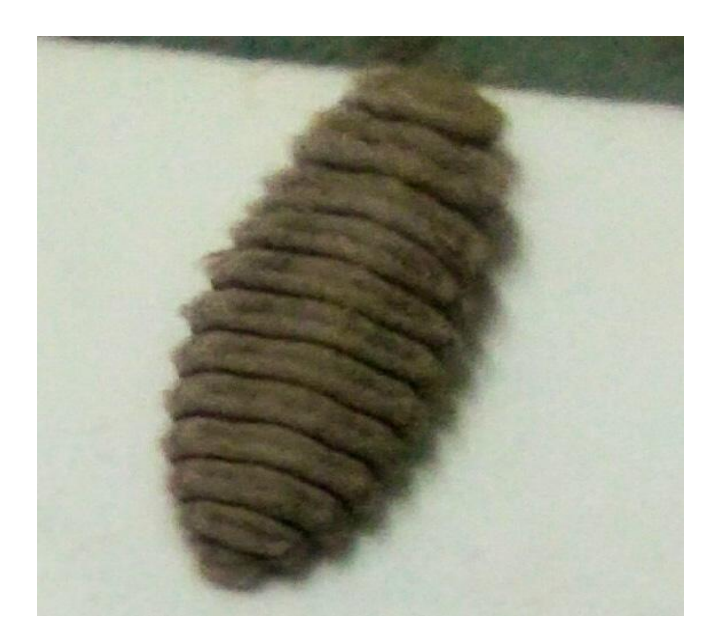
Plate 9. Fourth instar larva of ladybird beetle (Rodolia sp.)