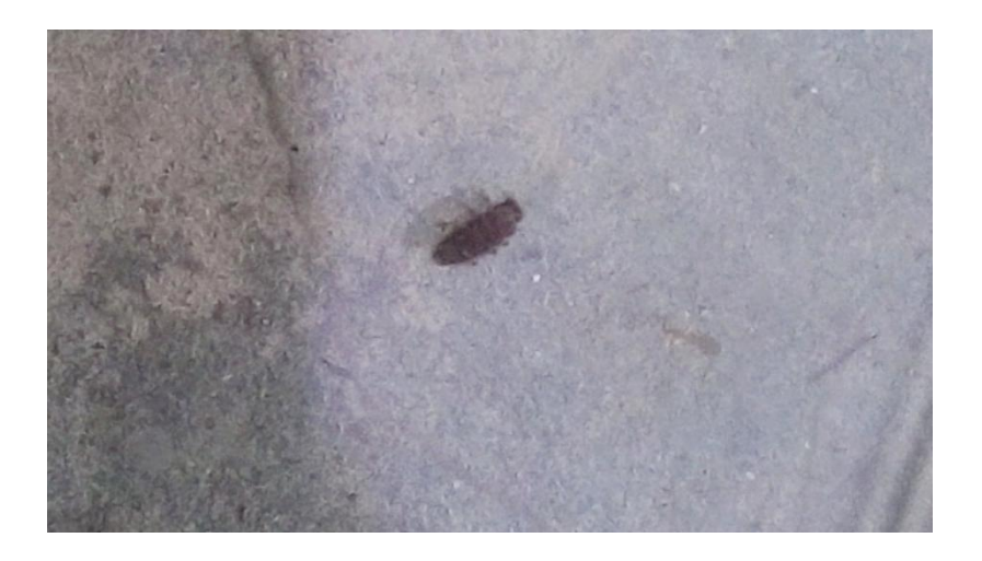
Plate 7. Second instar larvae of ladybird beetle ( Rodolia sp. )