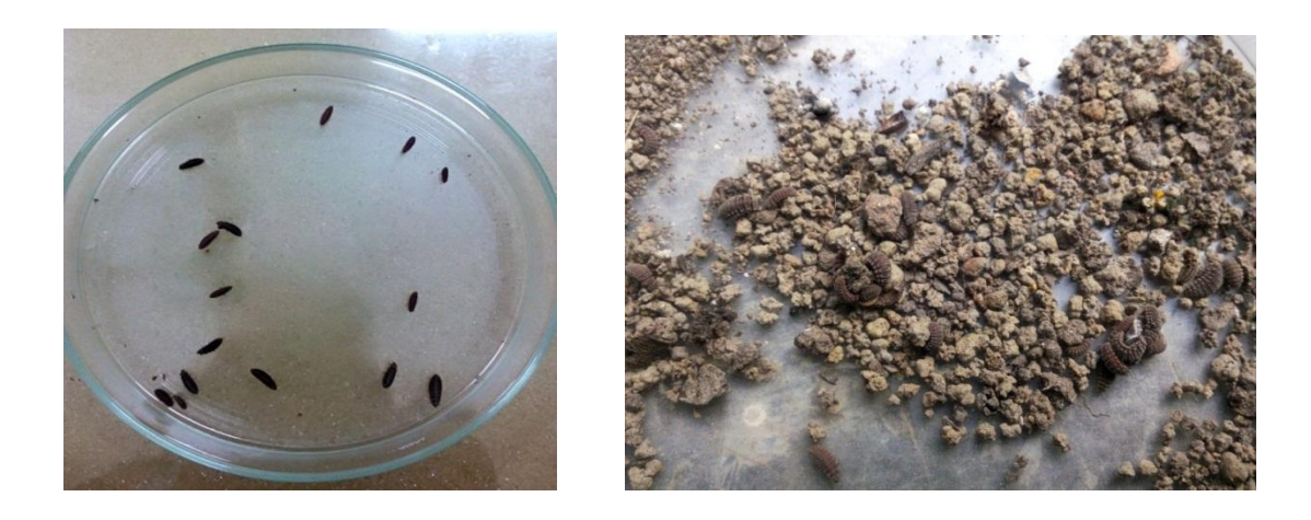
Plate 4. Collection of different instars of ladybird beetle( Rodolia sp. )