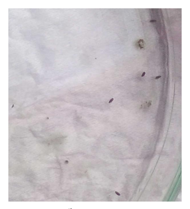
Plate 6. Newly hatched 1<sup>st</sup> instar larva of ladybird beetle ( Rodolia sp. )

In 1990, Debraj and Singh found that the duration of 1^{st} instar larvae of C. transversalis (F.) was 4.69 days on Aphis craccivora Koch at 18^{0} C.