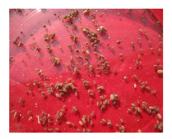
Plate 2. Collection of 1<sup>st</sup> instar nymph of mango mealybug

Mango mealybugs of different instars were collected from infested mango orchards of Entomology research field, Sher-e-Bangla Agricultural University (Plate 2 and 3). Bugs were collected from the infested mango leaves, stems, twigs and inflorescences. Eggs of mango mealybug were collected from the soil under the tree infested mango orchards. Ladybird beetle larvae of different instars were also collected from the same mango orchard. The ladybird beetles were collected not only from mango trees but also from other trees of the orchard.