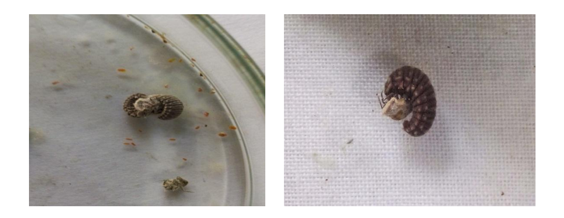
Plate 13. Ladybird beetle ( Rodolia sp. ) predate mango mealybug.

1^{st} instar, 35.66 2^{nd} instar and 45.00 3^{rd} instar cotton mealybug and 7.11 adult stage cotton mealybug, respectively, whereas 3^{rd} instar beetle consumed 121.66 1^{st} instar, 51.66 2^{nd} instar and 54.33 3^{rd} instar cotton mealybug and 8.21 adult stage cotton mealybug. Adult female of this beetle consumed higher number of mealybugs than adult male during its whole life.