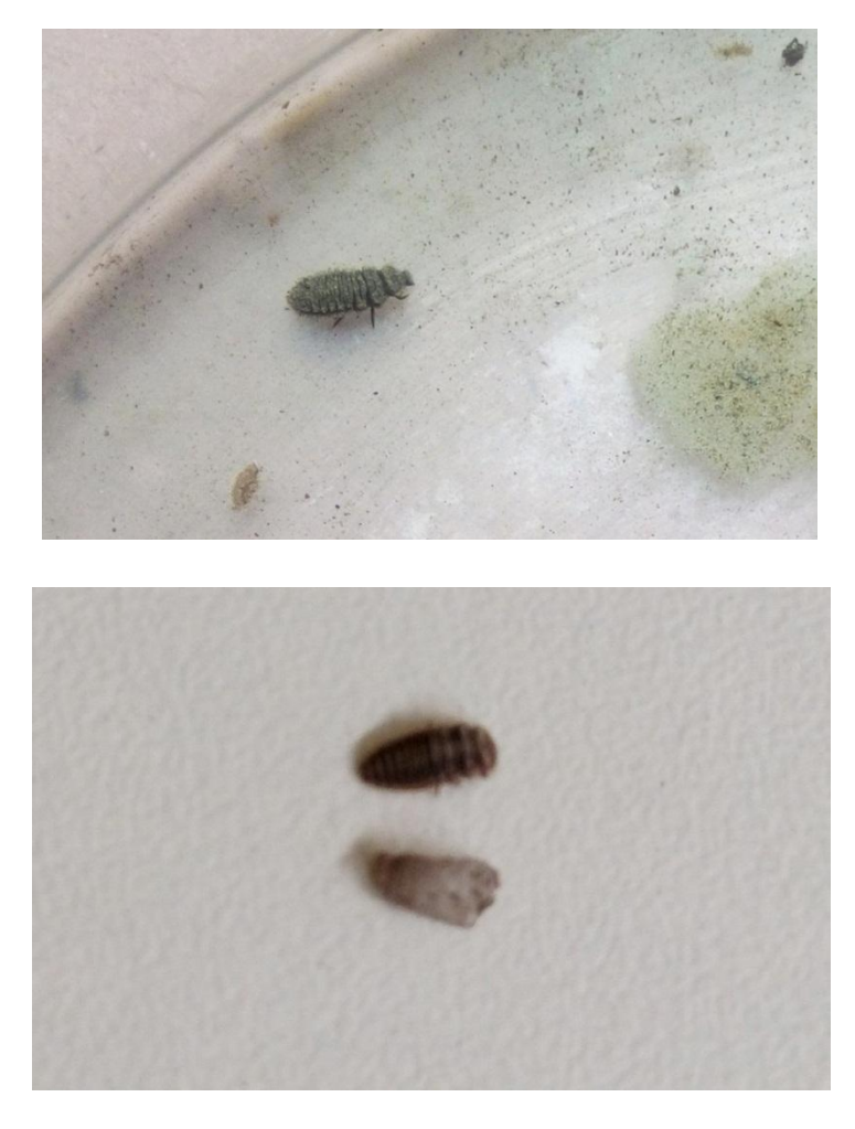
Plate 8. Third instar larva of ladybird beetle (Rodolia sp.)