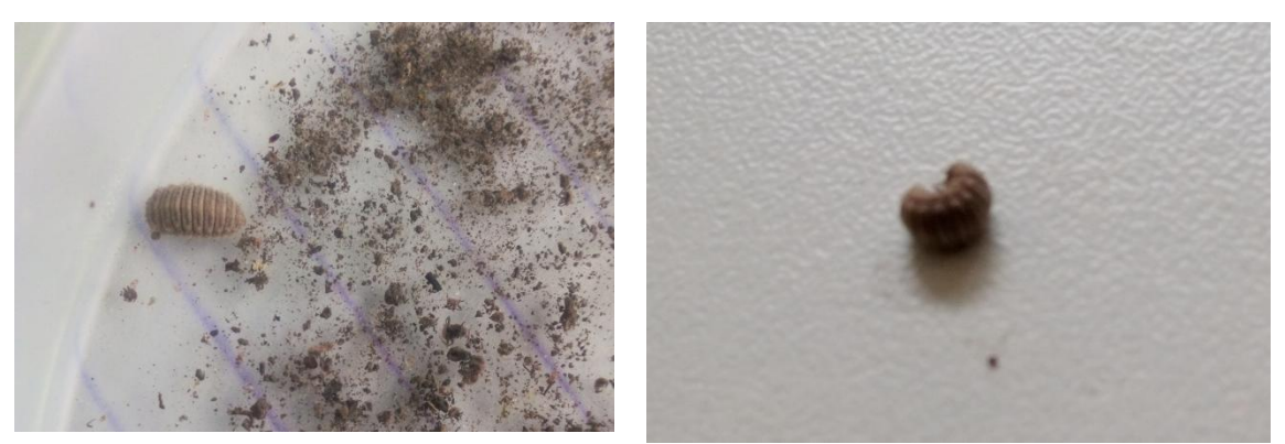
Plate 10. Pre-pupal stage of ladybird beetle( Rodolia sp. )