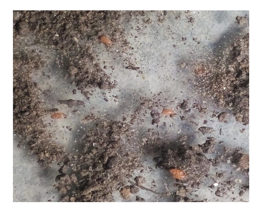
Plate 5. Eggs of ladybird beetle ( Rodolia sp. )