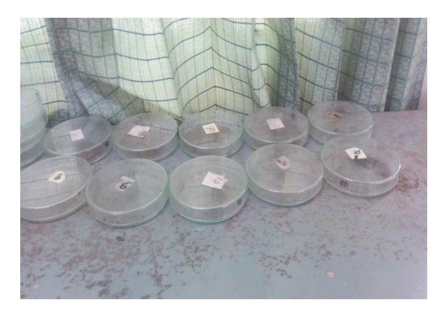
Plate 1. Petri dishes to study the biology of ladybird beetle ( Rodolia sp. )

From the laboratory culture adult ladybird beetles were confined for egg laying in Petri dishes (9.0cm x 1.0cm). Ten Petri dishes were maintained (Plate 1.). The beetles were observed to record incubation period. Eggs laid by each female during 24 hour were counted and kept in separate Petri dishes to determine the total number of eggs laid per female. The color, length and breadth, and shape of the egg were also observed. After hatching of eggs young larvae were transferred individually to ten Petri dishes. The mango leaves infested with mango mealybugs were provided as food for the predator larvae every morning. The larvae were observed twice daily until pupation to record the number of instars, the length and breadth of 1<sup>st</sup>instar, 2<sup>nd</sup> instar, 3<sup>rd</sup> instar and 4<sup>th</sup> instar larvae and duration of each instar. Pupae were kept undisturbed in the respective Petri dishes until the emergence of adult to record the duration of pre-pupae, pupae and the adult.