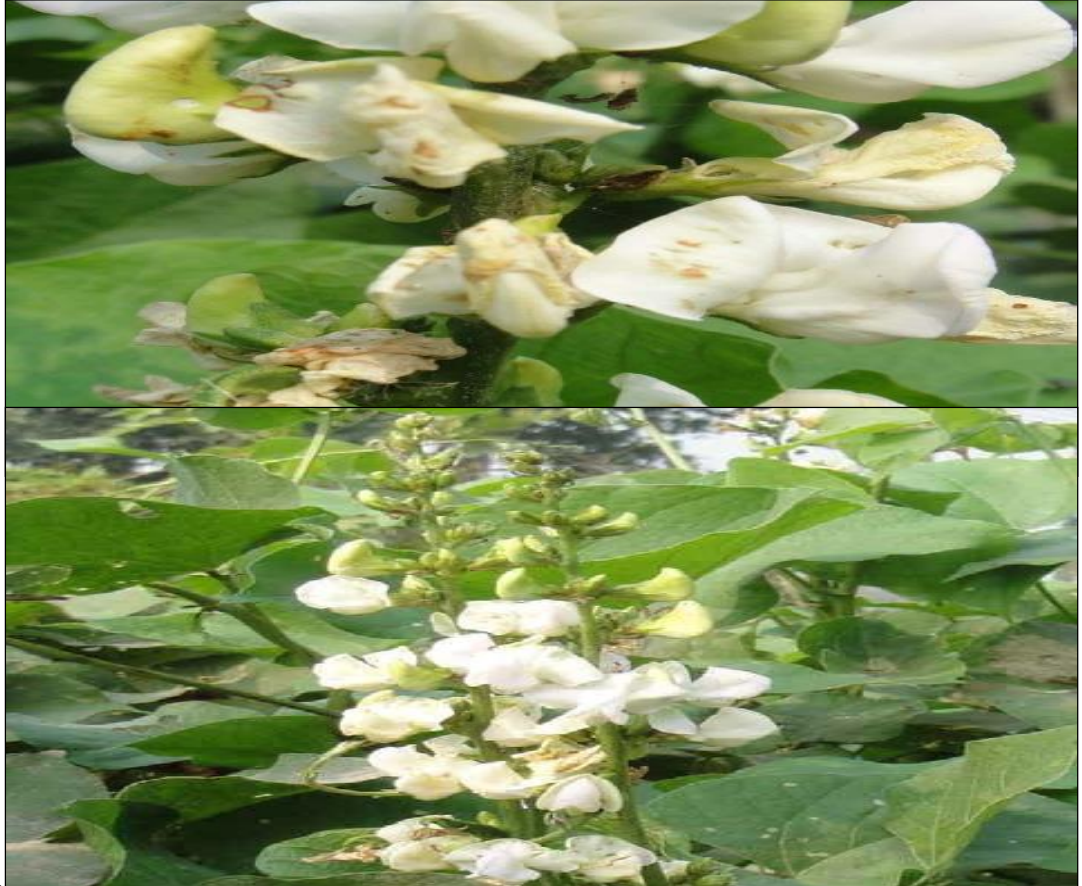
3.15.10 Number of inflorescence plant

Total number of inflorescence from each individual plantwas recorded in each treatment (plate 8 and 9).