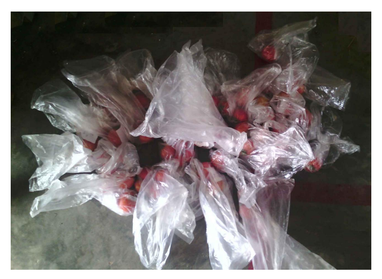
Appendix Fig 4: Harvesting of tomato