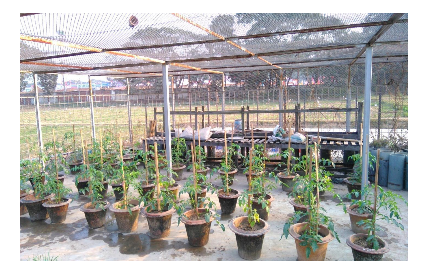
Appendix Fig 1: Tomato experiment in the net-house