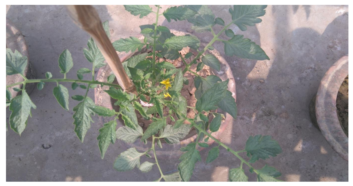
Appendix Fig 2: Flowering of tomato Plant