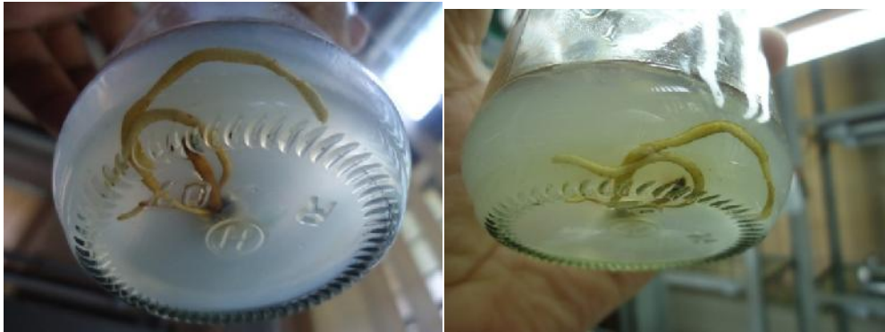
Plate 8. The maximum length of roots initiated at 42 DAI on MS medium supplemented with T 4 (2.0 mg/L) IBA in white variety