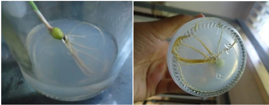
Plate 7. The maximum no. of roots initiated at 42 DAI on MS medium supplemented with T 4 (2.0 mg/l IBA) in white variety