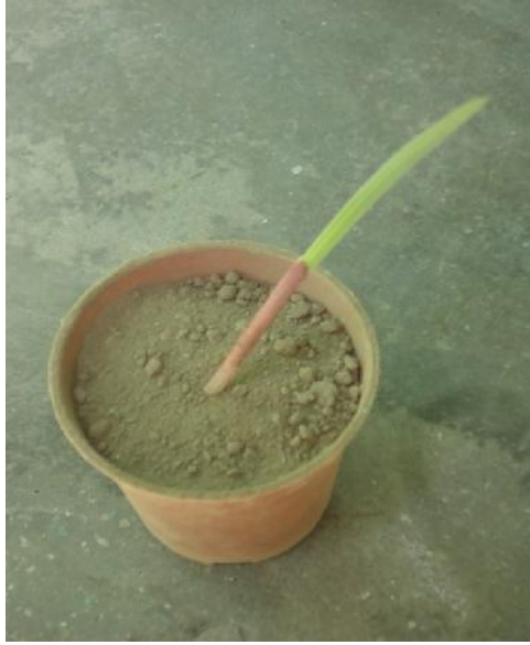
Plate 9. Transfer of plants in potting mixture (sand:soil:compost=1:1:1) for acclimatization